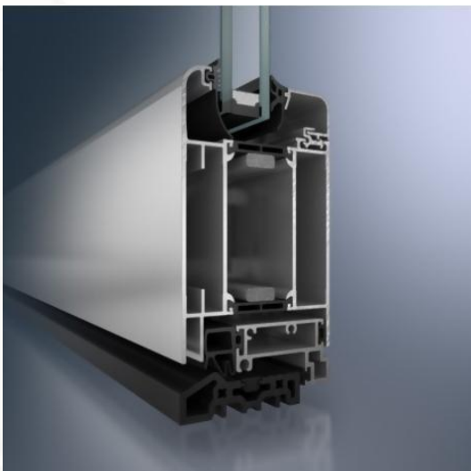
Schüco ADS 70 SL.HI (Soft Line)