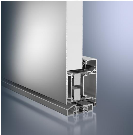
Schüco ADS 70 HI