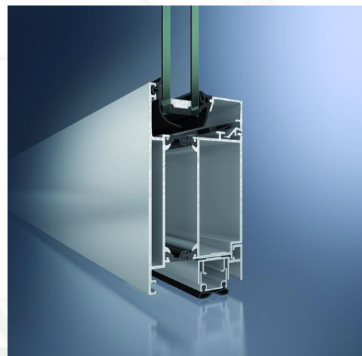
Schüco ADS 70 HD (Heavy Duty)