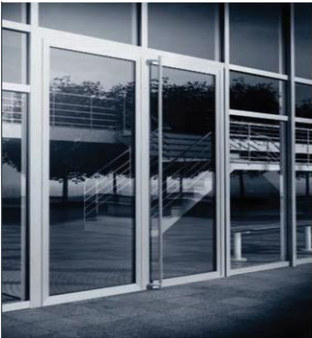
Schüco door ADS 70 HD

The installation of Schüco doors is the ideal solution for high traffic frequency and large openings. Double-leaf full panic doors in WK2 are also possible in conjunction with Schüco door systems.