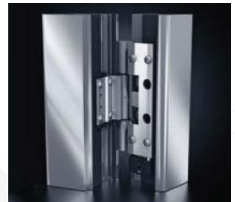
Cylindrical hinges for Schüco ADS HD